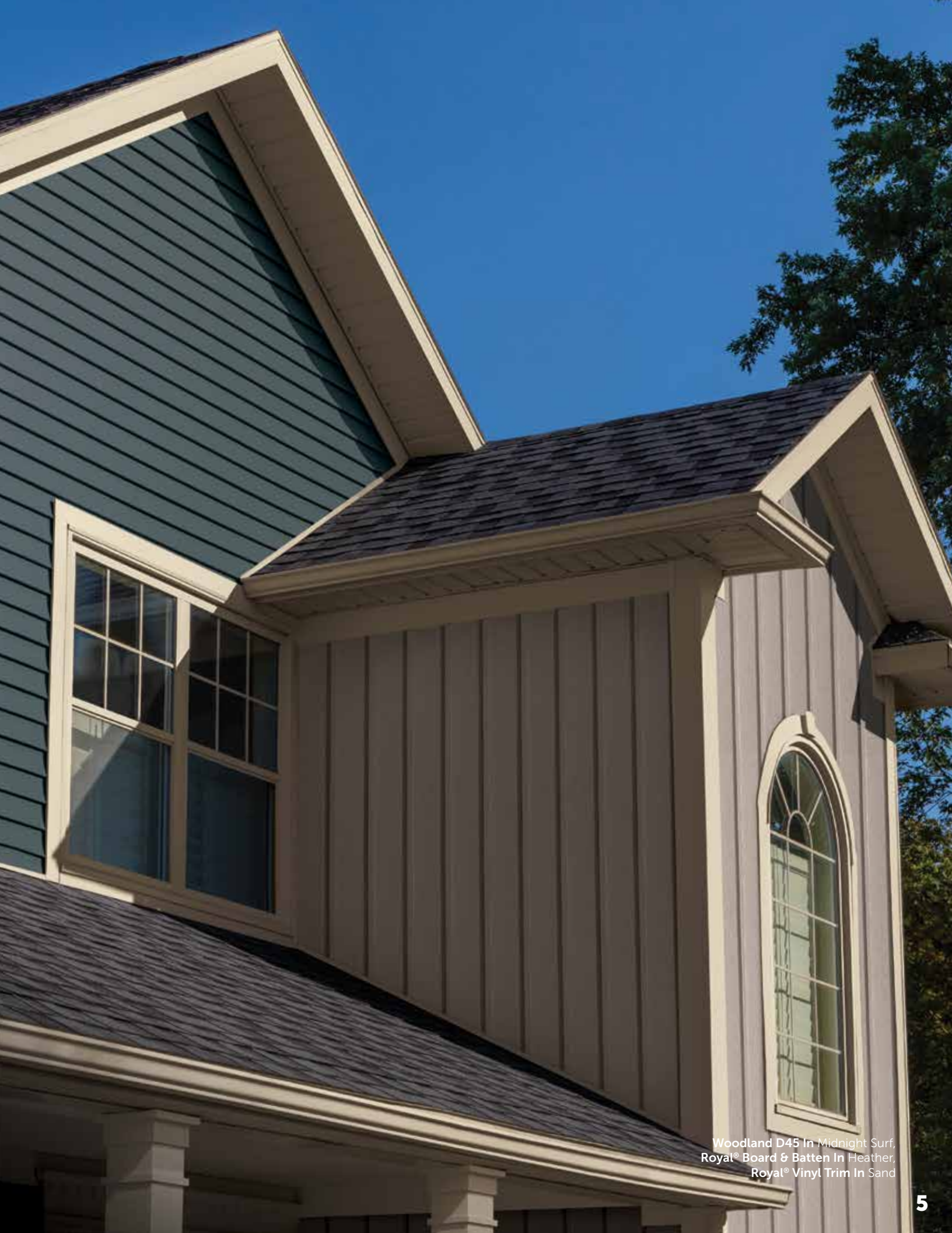
Woodland D45 In Midnight Surf, Royal® Board & Batten In Heather, Royal® Vinyl Trim In Sand