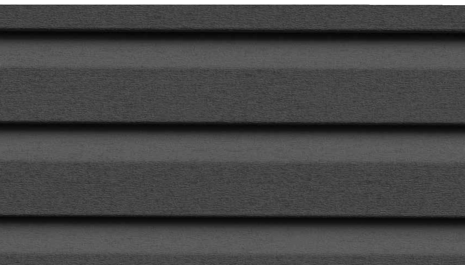
Woodland D45D In Ironstone