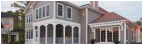
CELECT® CELLULAR COMPOSITE SIDING