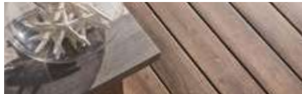
ZURI® PREMIUM DECKING