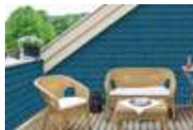
PORTSMOUTH™ SHAKE & SHINGLES