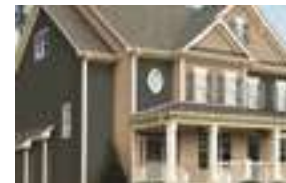
ROYAL® SHUTTERS, MOUNTS & VENTS