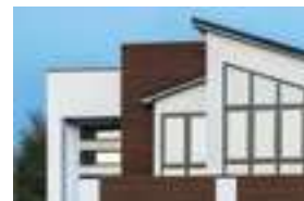
CEDAR RENDITIONS™ ALUMINUM SIDING