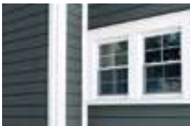
ROYAL® TRIM & MOULDINGS