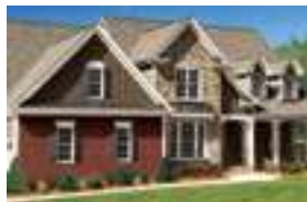
HAVEN® INSULATED SIDING