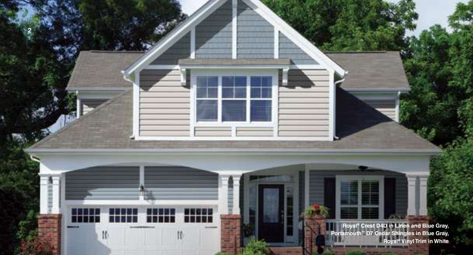
Royal® Crest D4D in Linen and Blue Gray, Portsmouth™ D7 Cedar Shingles in Blue Gray, Royal® Vinyl Trim in White